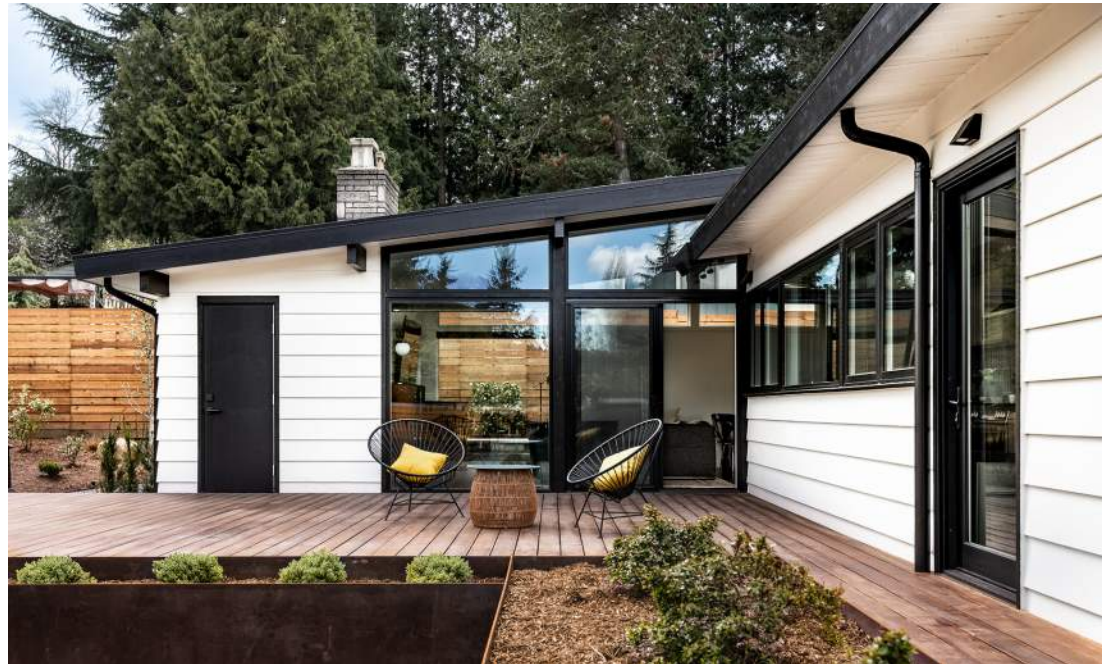
The home's new south-facing windows connect the living areas with the private yard.