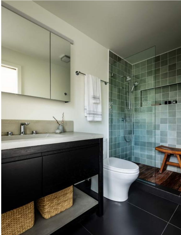
The renovation introduced an additional bathroom, to round out the total to two.