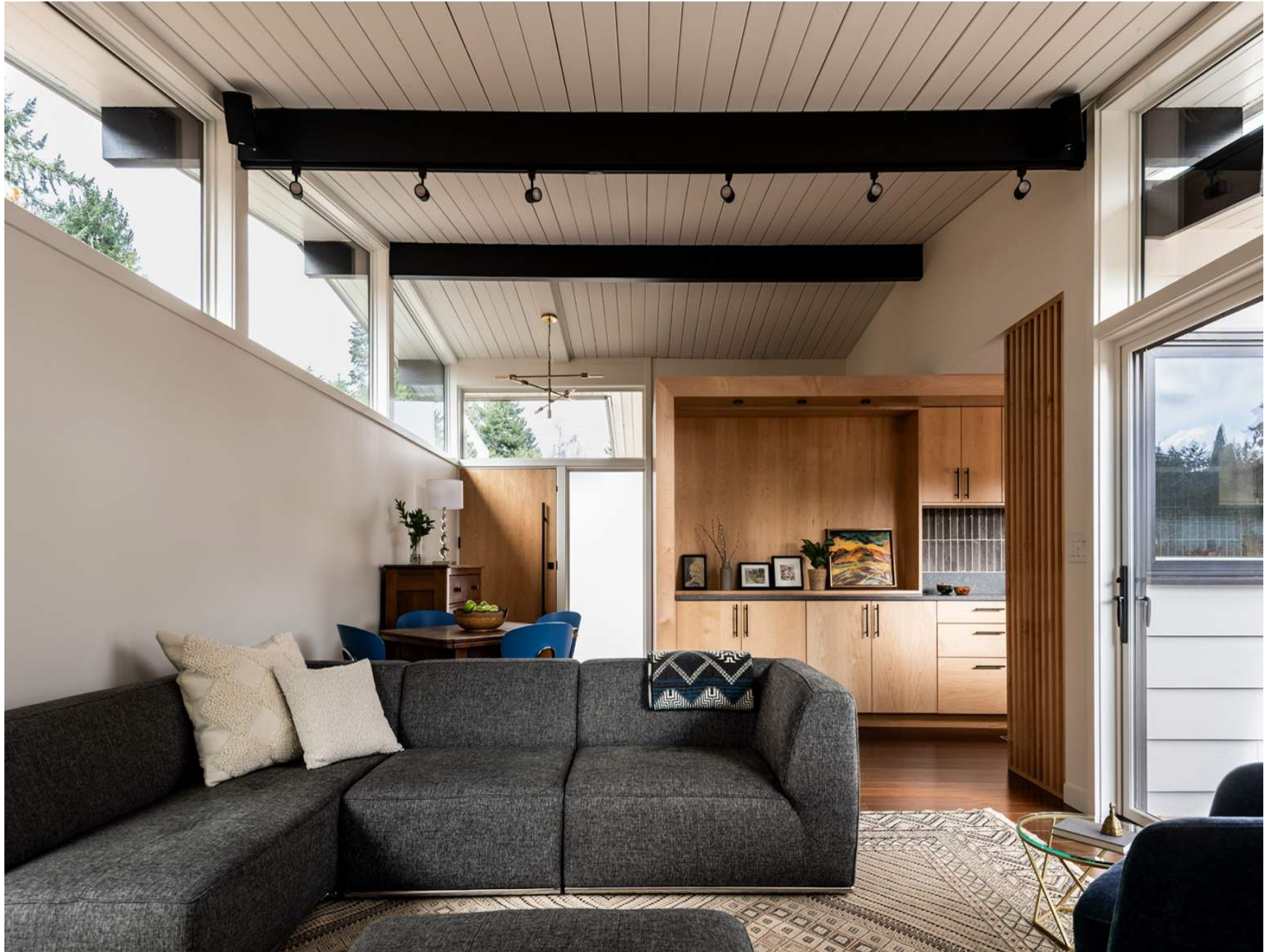
The living room features a Malibu sofa from Kasala and a Moroccan wool carpet the owner inherited