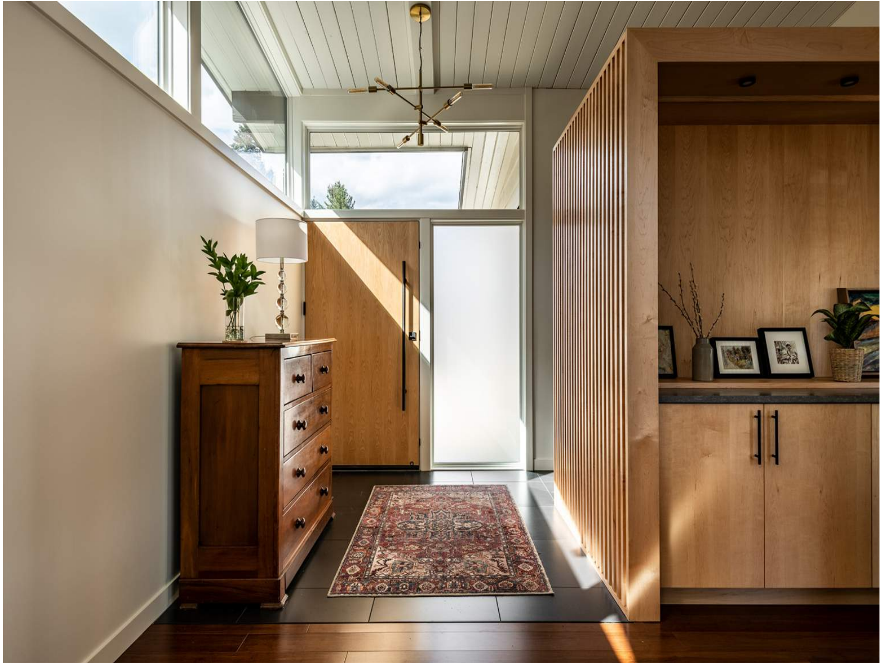
At the entryway, an antique dresser (a family heirloom) sits beneath a West Elm chandelier.